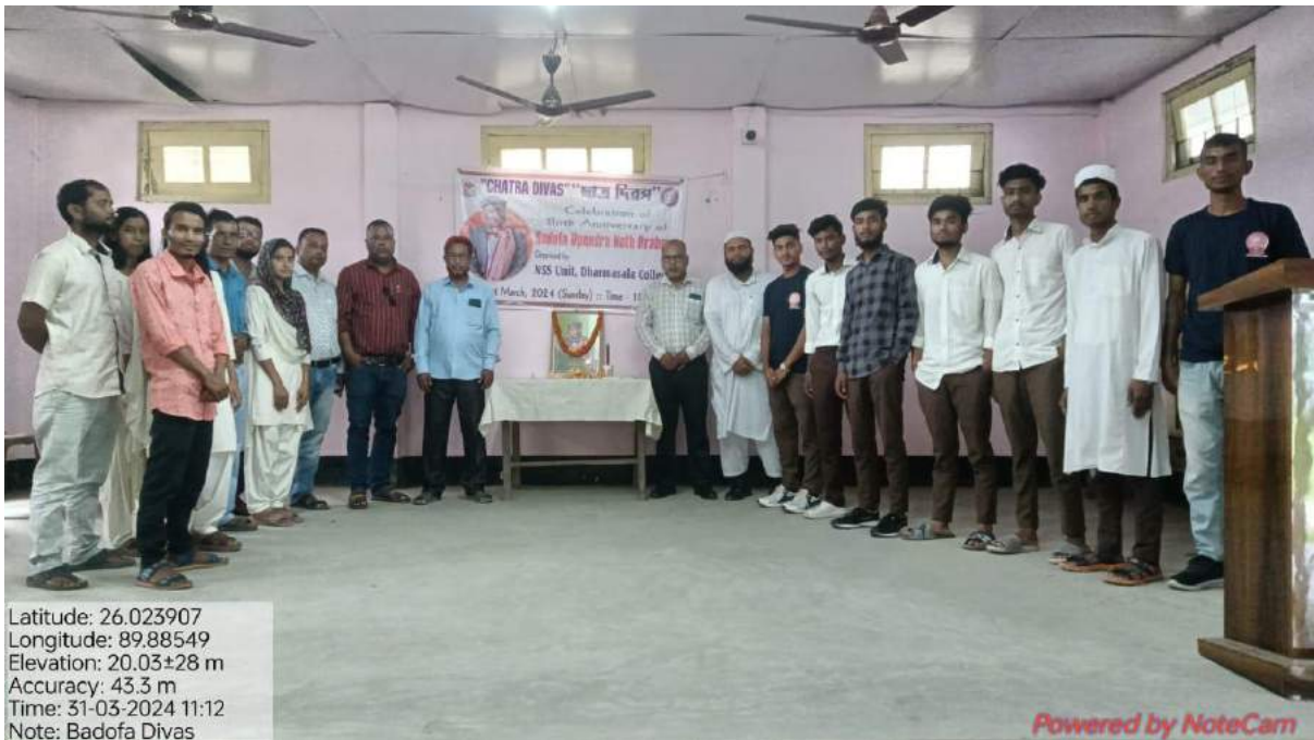
Celebration of Chatra Divas.