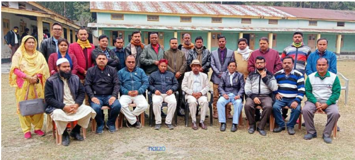
President, GB, Teaching and Non-Teaching Staffs of the College.