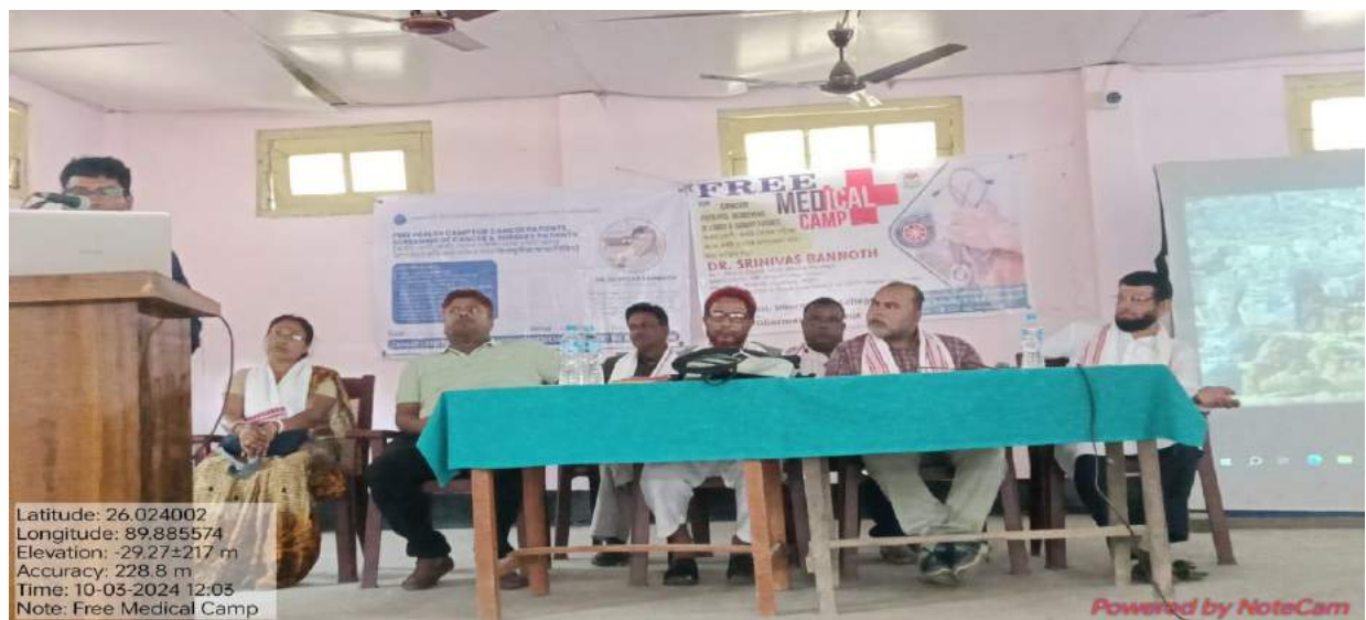
Free Medical Camp held at College on 10/03/2024