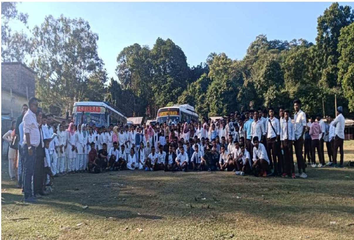
Excursion Tour to Deeplai Beel and Mahamaya Temple, Bagribari, Dhubri on 25/11/2023.